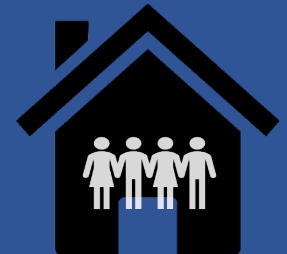
Cooperative Housing Corporations